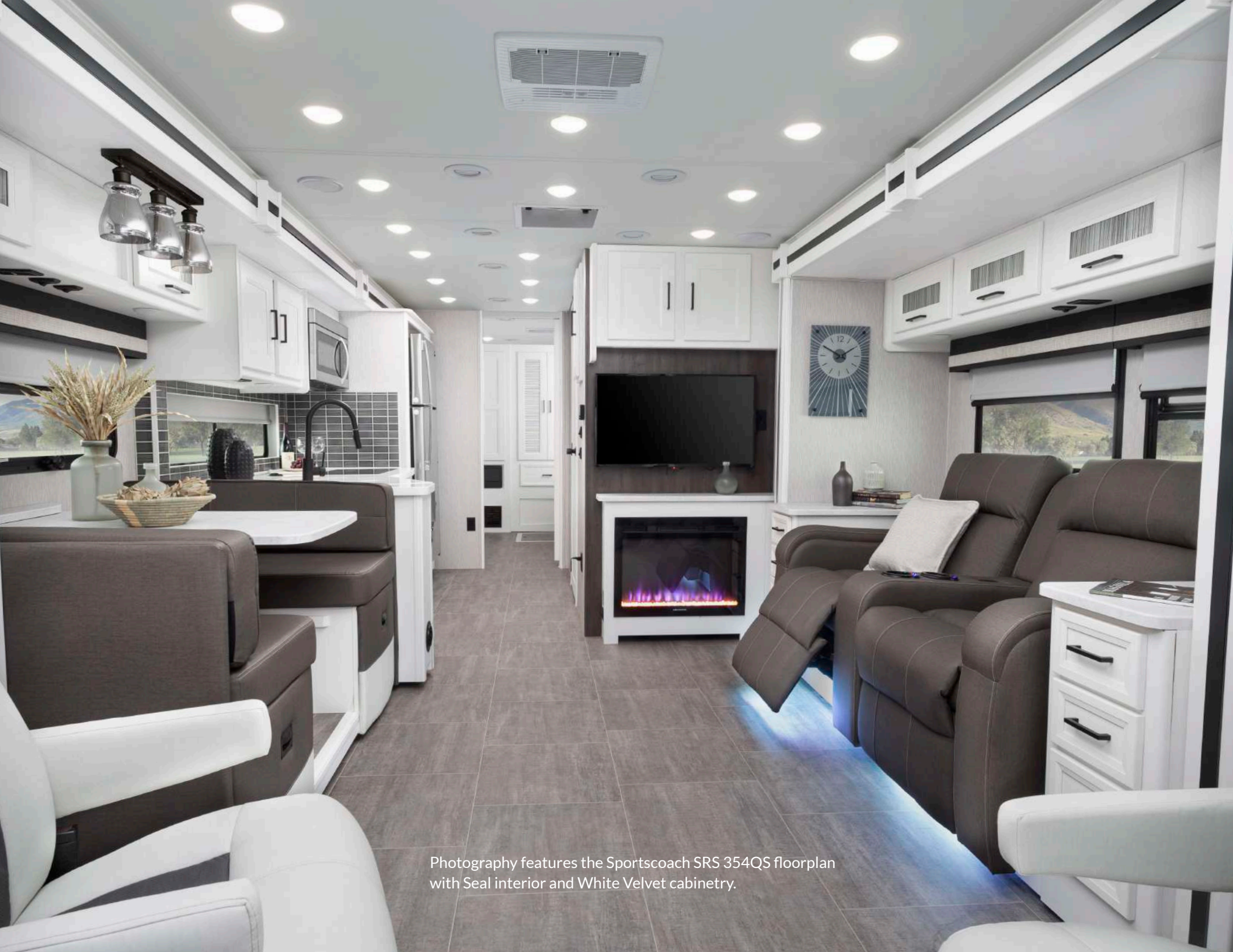
Photography features the Sportscoach SRS 354QS floorplan with Seal interior and White Velvet cabinetry.